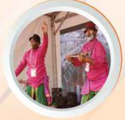
Cultural Performances (Folk & Classical)