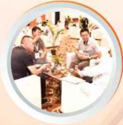
B2B sector presentation and roundtable meetings