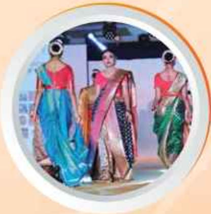
Fashion Shows and Band Performances