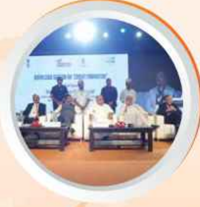
Knowledge Sessions, Seminars, Conclaves