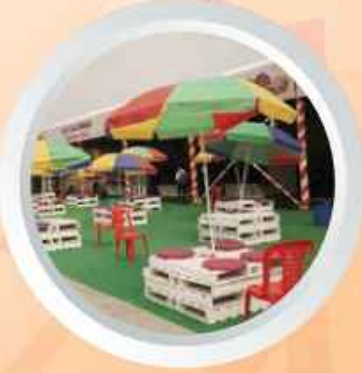
UP Ka Swad (Cuisine and Culinary Arts)